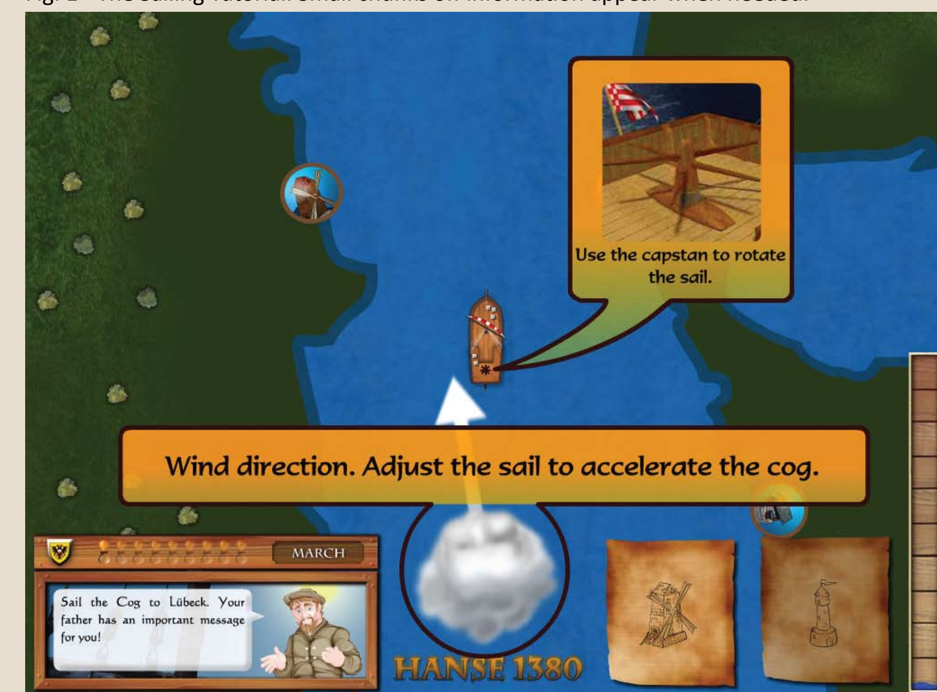
Fig. 1 - The Sailing Tutorial. Small chunks off information appear when needed.